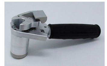
Table tools/accessories PowerClip®